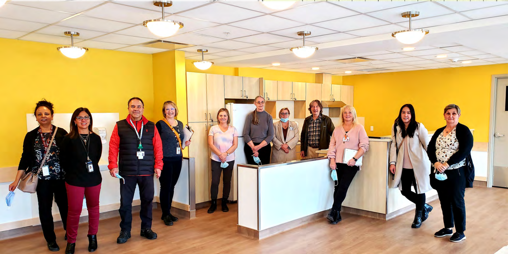
Nov-16 AHS Final Inspection, Eden Dining Room/Lounge